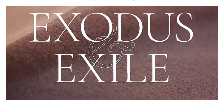
Sign-up for Daily Emails During Lent to Journey Home online at StPaulCenter.com/Exodus

*Denotes Mass at the Church. Please contact the office to offer a Mass for your special intention or the soul of a dearly departed family member or friend. Customary donation is $10. Online requests can be made at: stjosephpc.org/mass-intentions