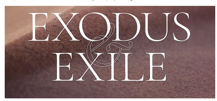
Sign-up for Daily Emails During Lent to Journey Home online at StPaulCenter.com/Exodus

*Denotes Mass at the Church. Please contact the office to offer a Mass for your special intention or the soul of a dearly departed family member or friend. Customary donation is $10. Online requests can be made at: stjosephpc.org/mass-intentions