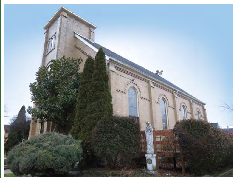
Church: 140 West Avenue