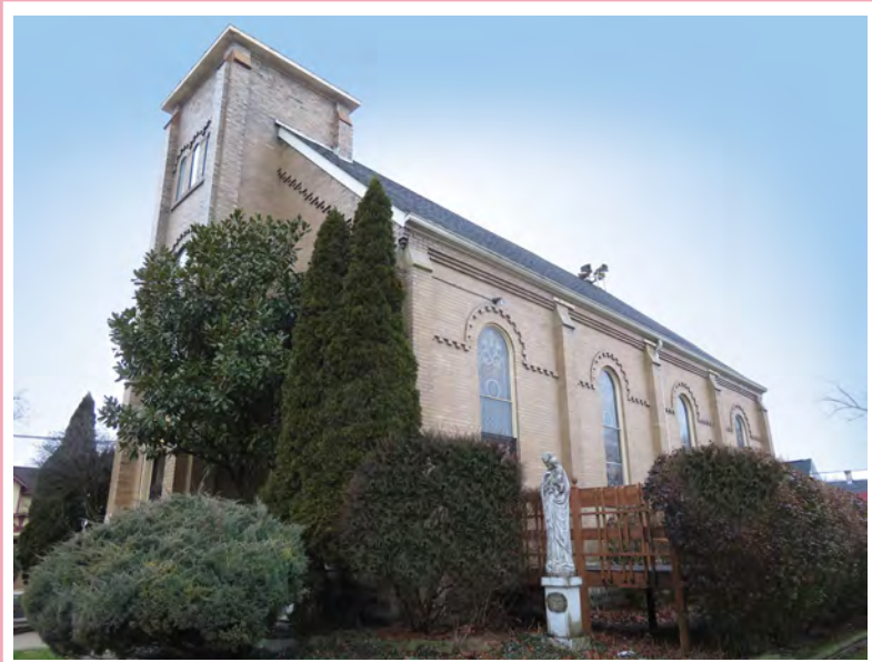
Church: 140 West Avenue