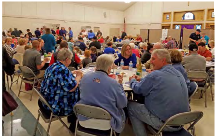
This shows a typical crunch-time crowd with 19 full tables, and sometimes a spillover into the cry room.