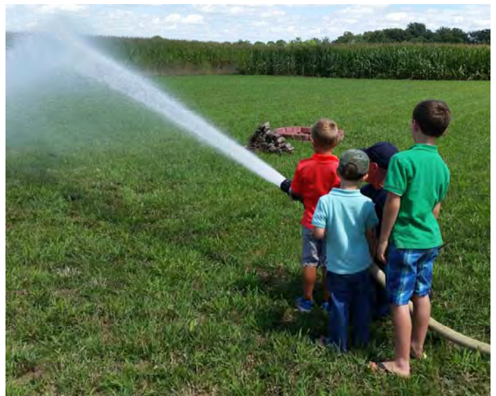
A rookie fireman wanna-be tends the hose while the next rookies await their turn, supervised by a real fireman.