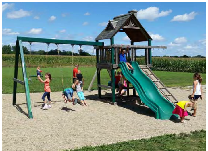
The weather was perfect for our Parish kids to make liberal use of the PAC playground equipment.