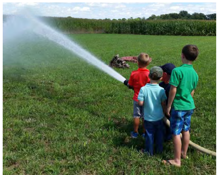
A rookie fireman wanna-be tends the hose while the next rookies await their turn, supervised by a real fireman.