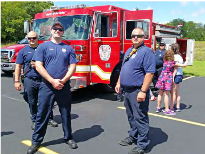
Our neighbors, the Pleasant Valley Fire Department, opened their fire vehicles for the kids (and grown-ups) to see inside.