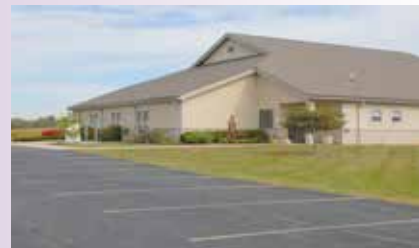
Parish Activity Center and Parish Office 670 W. Main Street Plain City, OH 43064

Confessions at church: Saturday after 9 am Mass and 3:30 pm Also by appointment.