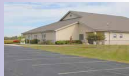
Parish Activity Center and Parish Office 670 W. Main Street Plain City, OH 43064

Confessions at church: Saturday after 9 am Mass and 3:30 pm Also by appointment.