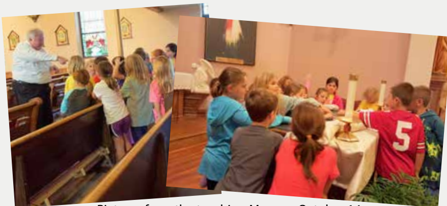
Pictures from the teaching Mass on October 14.