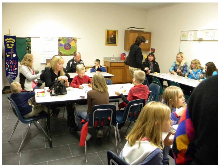
Children were in abundance at the signing event, a usual occurrence when sweets are available.