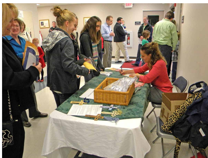
Mothers and fans line up to receive their signed copy of Welcome Baby Jesus .