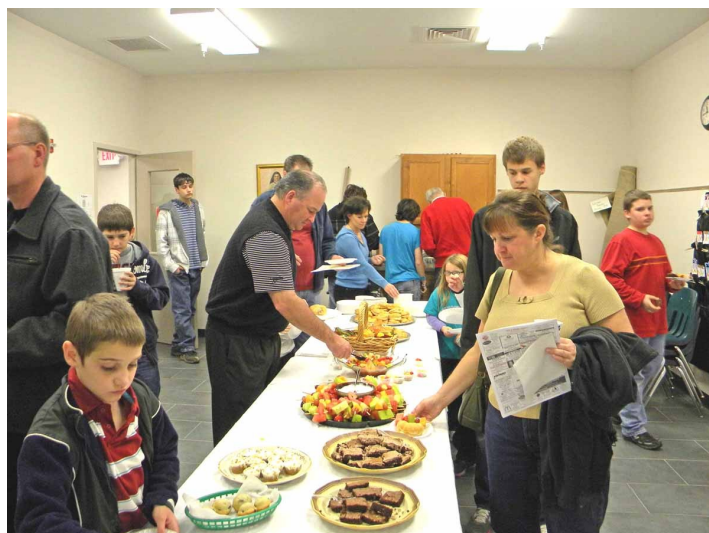
Book signing attendees enjoyed a great spread of sweets and fruits to go with their beverages.