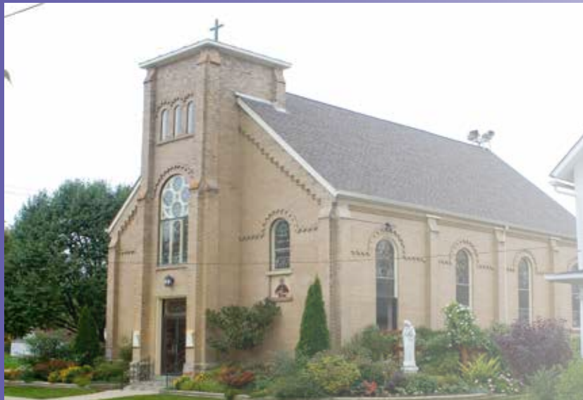
140 West Avenue, Plain City Ohio