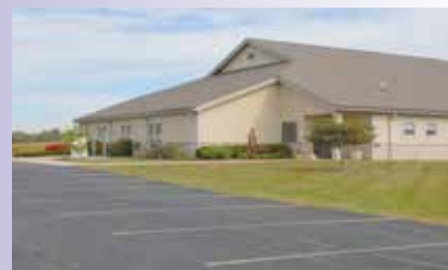
Parish Activity Center and Parish Office 670 W. Main Street Plain City, OH 43064

Confessions at church: Saturday after 9 am Mass and 3:30 pm Also by appointment.