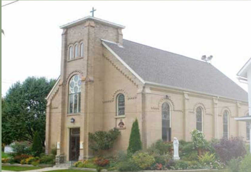
140 West Avenue, Plain City Ohio