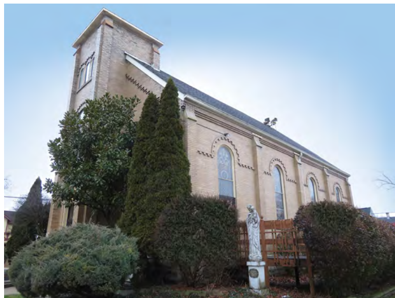
Church: 140 West Avenue