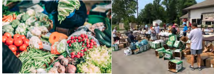
In partnership with Mid Ohio Foodbank

February 15th 3rd Thurs of each Month (Except December) 9:30 AM-11:30 AM Our Lady of Lourdes 1033 W. 5th St., Marysville