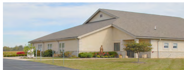
Parish Activity Center and Parish Office 670 W. Main St Plain City, OH 43064

FORMED www.formed.org THE CATHOLIC FAITH. ON DEMAND. Parish Code: RFTRYT