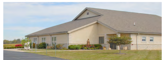
Parish Activity Center and Parish Office 670 W. Main St Plain City, OH 43064