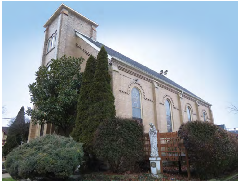
Church: 140 West Avenue