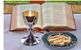
Please sign-up for Christmas Masses.